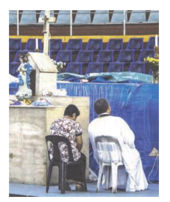
Email: 20th Feb 2012

...I had the grace of baptising and confirming a baby who is in danger of death — a baby that was taken care of by the mission and who is still in hospital. It is probable that the baby will not live much longer. Another little saint in heaven!