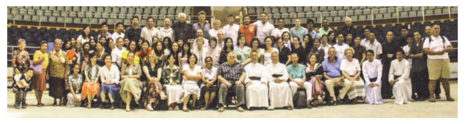
There were 115 volunteers from all four corners of the world who treated 3500 patients.