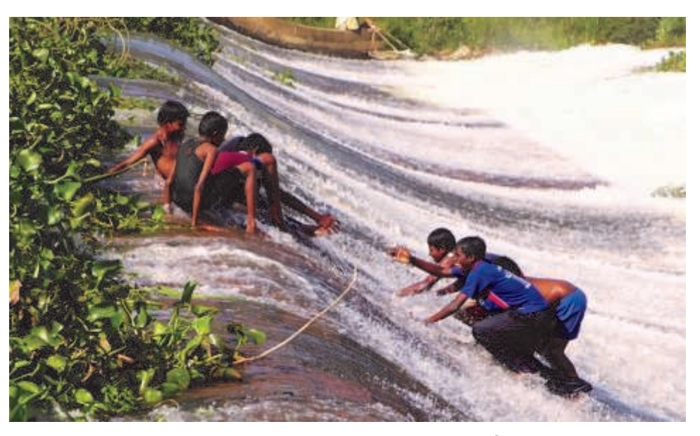
"You can do it!" The boys playing at the dam during our brief monsoon season.