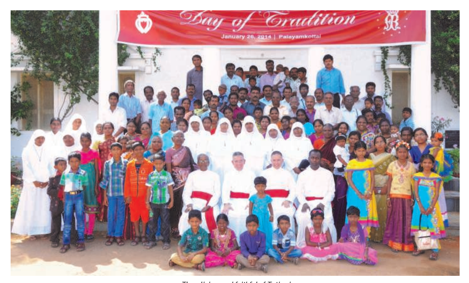
The religious and faithful of Tuticorin.