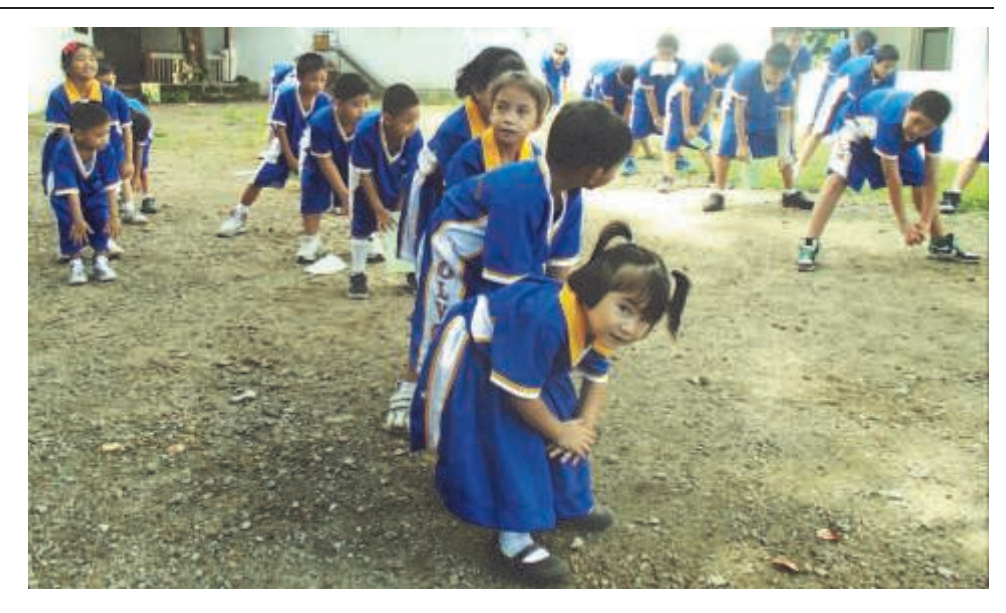
"Mens sana in corpore sano. We're working to make healthy minds in healthy bodies!" Says One little tot.

22nd August: Feast of the Immaculate Heart of Mary. We joined Filipino Day to