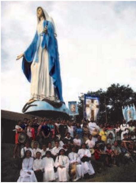
Pilgrims at the foot of the enormous statue of Our Lady at Pilar