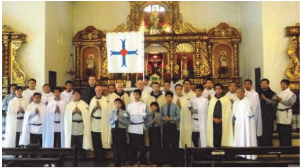
Mass and the dubbing ceremony, eight new Knights and seven new Donates for the service of Christ the King and our Lady, next to the Order's gonfalon and their brothers.

An International Chapter of the Order of the Knights of Our Lady took place at Our Lady of Victories Church and School, Manila, from 6th—9th August 2010, for the English-speaking members of the Order (French speakers participate in the yearly General Chapter in France). Mem-