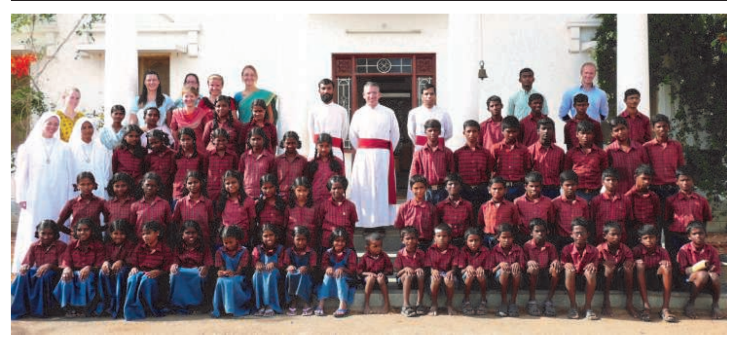
Veritas Academy 2010-11