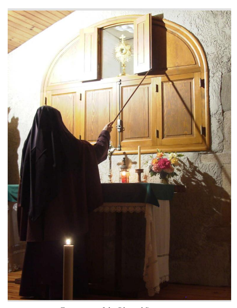
Exposition of the Blessed Sacrament