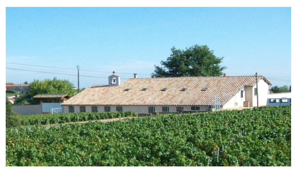
The Convent of Saint Clare, Morgon, France

The convents and monasteries consecrated to prayer are permanent witnesses to the existence of God. They are the precious jewels of Holy Church, the most pure riches of a world that hardly knows they are there. For all those trying to make sense of this world, and their lives, these convents are a light on a candlestick. The peace, joy and simplicity that reign there bear witness to the solid foundation on which the convent rests and much could be learnt there on how to build a life on an indestructible foundation. These convents are spiritual fortresses opposed to the materialism which forfeits so many good values; these are reserves of pure christianism for a decaying Christendom.