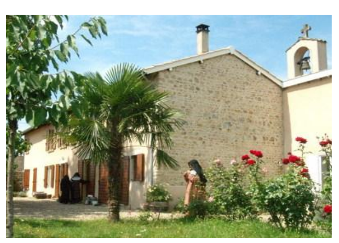
The new convent up and running