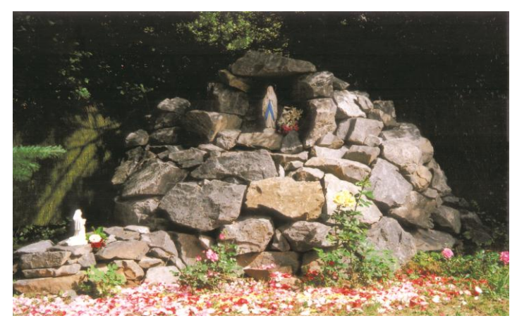
The Immaculate Virgin is the Patron and Queen of the Seraphic Order and the Divine Shepherdess of the community (the community are consecrated to Mary, who they hold as their true Mother Abbess)