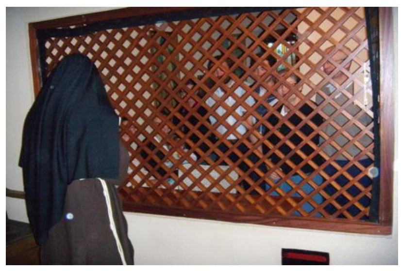
The 'parloir' (visiting room)

Confession and spiritual direction are provided to the nuns by the Capuchin Fathers.