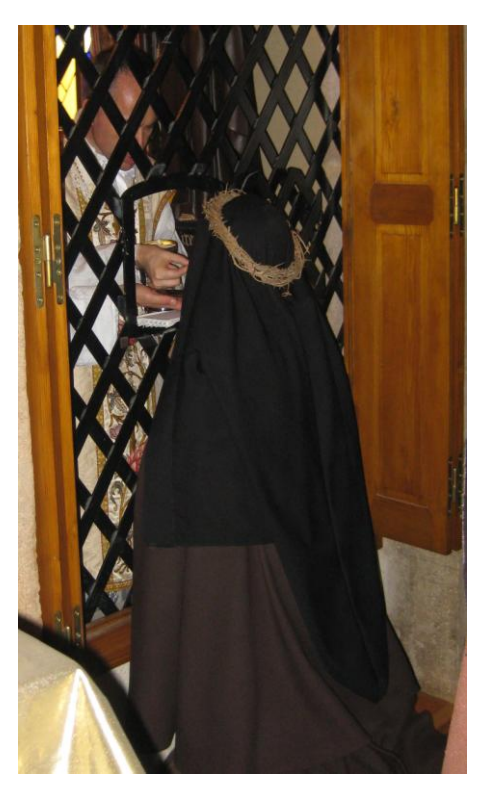
The newly professed, crowned with thorns, receives communion.